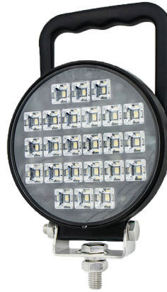
711.034 Handle & Switch