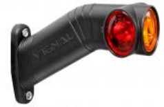
D14426 DX LED - Right End outline marker lamp LED 12/24V...