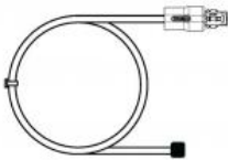
R14412 CP - Flat cable with 2 pin superseal to connect on...