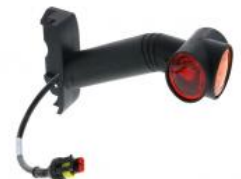
D14782 FA3 LC12 LED - End outline marker lamp LED right side 12/24V...