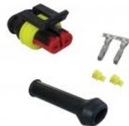
D13880 CONN - SUPERSEAL 2 way female connector repair kit