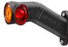
D14425 DX LED - Left End outline marker lamp LED 12/24V cristal...