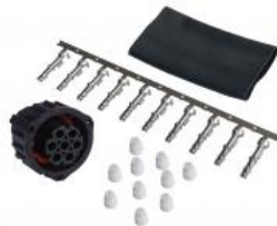
D11868 CONN - AMP connector 7-way female connector repair kit