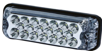
ECCO 3811 Series 20 LED Light Head