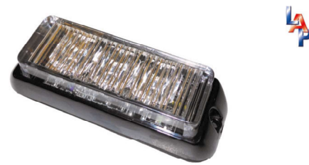
LAP Electrical 3 LED TIR Light Head