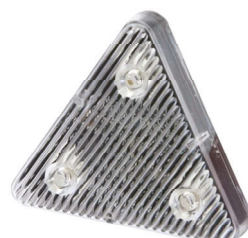
ECCO Stick-a-LED 3 LED TIR Triangular Light Head