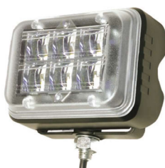
ECCO SecuriLED Bracket Mount LED Light Head