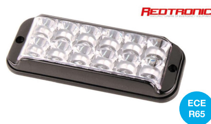
Redtronic Bullitt 12 LED FX Light Head