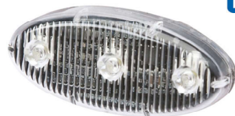
ECCO Stick-a-LED 3 LED TIR Oval Light Head