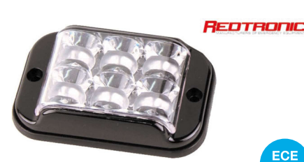
Redtronic Bullitt 6 LED FX Light Head