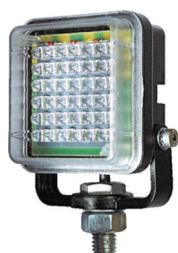
ECCO Vigiled Economy LED Light Head