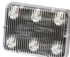
ECCO Stick-a-LED 6 LED TIR Rectangular Light Head