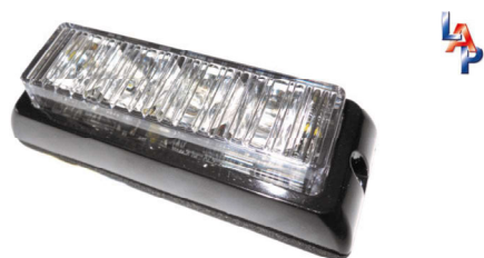
LAP Electrical 4 LED TIR Light Head