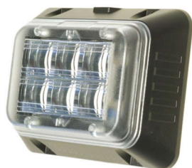
ECCO SecuriLED Surface Mount LED Light Head