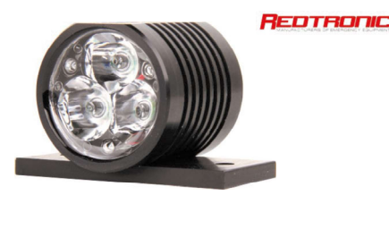
Redtronic Cluster 3 LED TIR Light Head