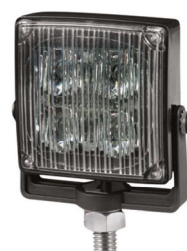
ECCO Vigiled II High Power LED TIR Light Head