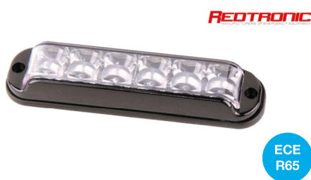
Redtronic Bullitt 6 LED FX Light Head