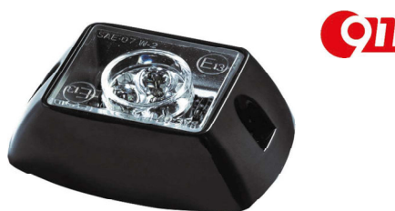
911 Signal P3 3 LED TIR Light Head