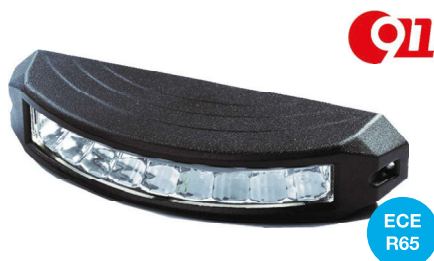
911 Signal C9 9 LED Reflex Wrap-around Light Head