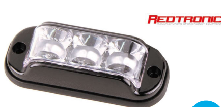
Redtronic Bullitt 3 LED FX Light Head