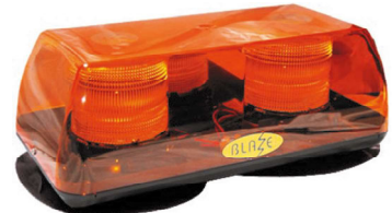
Vision Alert Blaze Magnetic Static Flash