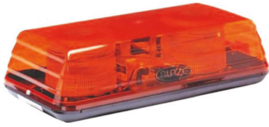
Vision Alert Blaze II Twin Bolt Xenon Strobe