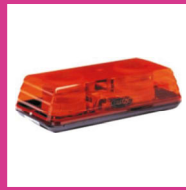
Xenon Strobe Page 44

Still popular today despite newer warning technology, a halogen rotator is a great value product to install and easily helps you conform to Chapter 8 as all of our rotating minibars are ECE R65 approved