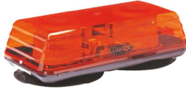
Vision Alert Blaze II Magnetic Xenon Strobe