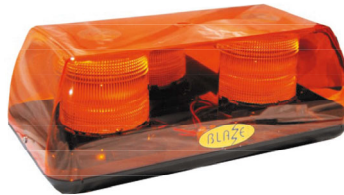
Vision Alert Blaze Twin Bolt Static Flash