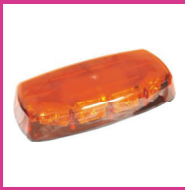
LED Page 39

Seen as the future replacement for xenon strobe minibars, these are reliable, incredibly energy efficient and compact. Some even come with selectable flash patterns to enhance your warning installation