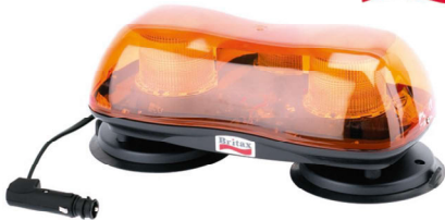
Britax Aerolite A434 Magnetic Xenon Strobe