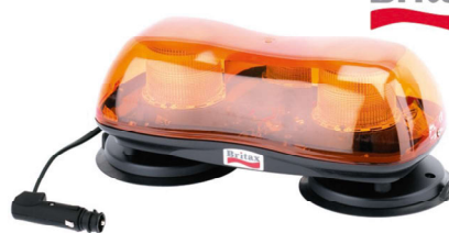
Britax Aerolite A444 Magnetic Static Flash