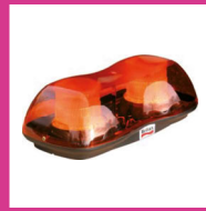
Static Flash Page 45

Longer lasting and more energy efficient than halogen minibars, the xenon variants are very popular with all types of customers. Not to be confused with airport static flash or LED