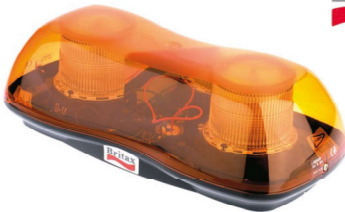
Britax Aerolite A441 Single Bolt Static Flash