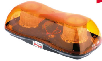
Britax Aerolite A431 Single Bolt Xenon Strobe