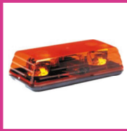
Rotating Page 43

Seen as the future replacement for xenon strobe minibars, these are reliable, incredibly energy efficient and compact. Some even come with selectable flash patterns to enhance your warning installation